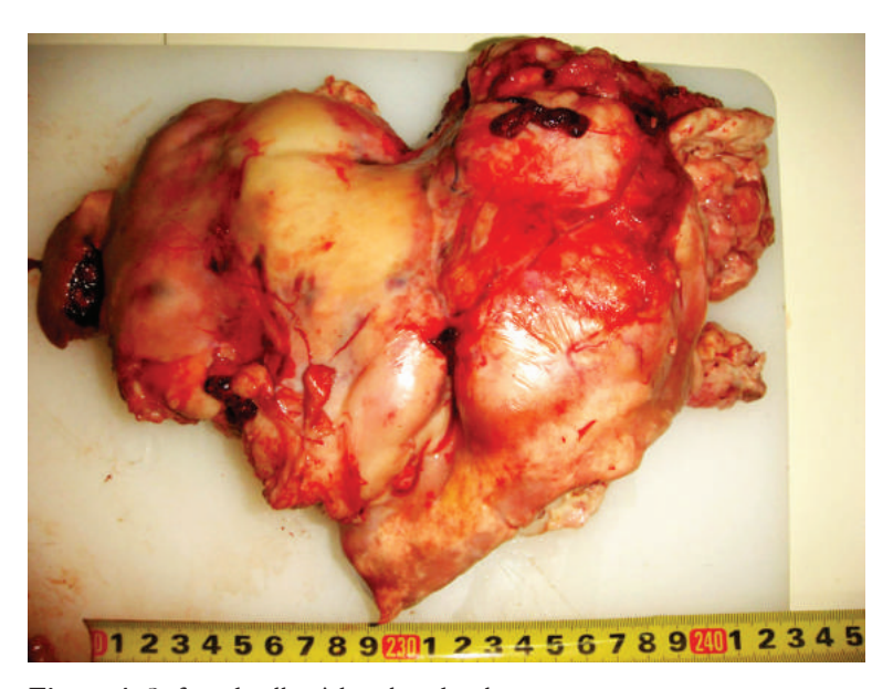
Figure 1. Soft and yellowish colored pulmonary mass.

and necropsy could not be done because of owner rejection. The removed mass was 23x20x6 cm in size, soft and yellowish in color (Fig. 1). Cytologically, numerous plasma cells which had mild basophilic cytoplasm, eccentric nucleus and perinuclear clear areas were seen. Occasionally cells with two or more nuclei were present (Fig. 2). Histopathologically, numerous neoplastic plasma cells with large eosinophilic cytoplasm showing marked anisocytosis and anisonucleosis with nucleus-cytoplasm asynchrony were noted. Some of these cells had notched nuclei. Multiple giant cells with up to 4-5 nuclei were seen. There were mitotic figures in some tumor cells (Fig. 3). Upon these findings, plasmacytoma was diagnosed.