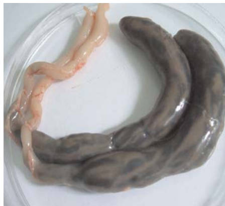
Figure 4. Cecum filled with foamy hemorrhagic content

both animals and humans. According to Janvier et al. (2000) in healthy people antibodies to C. jejuni can be found in 30% of cases. Antibody titer higher than 1:8 was considered positive. Antibody titer to C. jejuni in blood sera of the chickens from the first and second group ranged from 1:4 to 1:8, three weeks after infection. In the fourth week of the experiment the antibody titer ranged from 1:4 to 1:16.