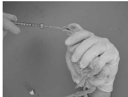
Figure 1. The procedure of artificial infection of chickens

API Campy strips were used for biochemical identification of Campylobacter jejuni , (BioMerieux, France). For serology the blood samples were taken 7 days post infection and every seven days thereafter.