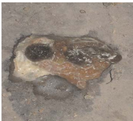
Figure 3. Feces of infected chicken

In chickens that did not have characteristic pathological findings in the liver after infection with C. jejuni , antibodies were found and C. jejuni was confirmed by bacteriological examination. Obviously, antibodies can be found in chickens that develop clinical symptoms and even if they do not become ill. This is similar in