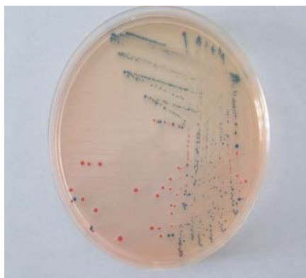
Figure 2. Red color on (RajHans Medium) means Salmonella findings

on the presence of Campylobacter jejuni . Cloacal swabs were placed in tubes with peptone water, while the liver, spleen and intestine were placed in Erlenmeyer dishes with 50 mL of peptone water. Peptone water was incubated at 37°C for 24 hours for pre-enrichment purposes. One milliliter of peptone water was transferred to semisolid media Rappaport Vassiliadis (HiMedia) according to the recommendation of Quinn et al. (2002).