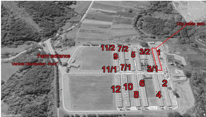
Figure 1. Geospatial farm setup Legend: No.1, 9 – gestating stable; No. 3/2, 7/2, 11/2 – farrowing room; No.5 – insemination stable; No. 3/1, 7/1, 11/1 – weaning stable; No. 2,4,6,8,10,12 – fattening stable