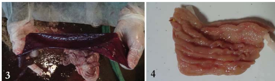
Figure 3. Hemorrhagic enteritis of small intestine – necropsy

portions of the intestinal crypts had a relatively characteristic structure. Connective tissue of the lamina propria was infiltrated by inflammatory cells (Figure 8).