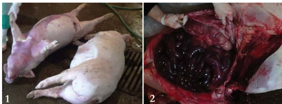
Figure 1. Pronounced distension of the abdomen of fresh carcasses – necropsy